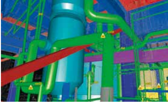
The automated Pipe Run feature lets users select points on connected, straight pipe sections, and the system automatically models a best fit pipe run with elbows in seconds.